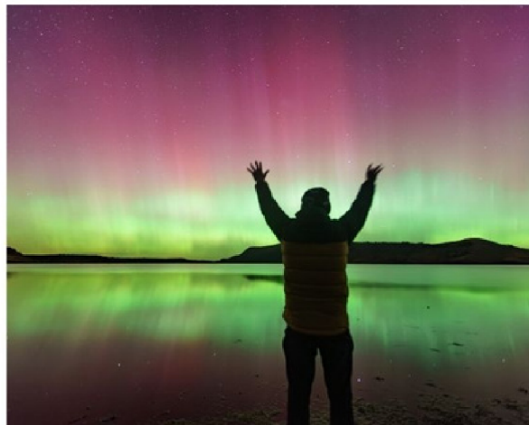
at Hoopers Inlet, Dunedin